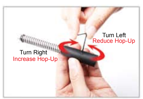
Use Allen Key adjust the Hop-Up.