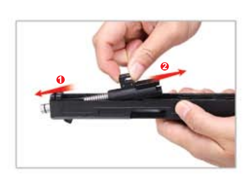
Remove the Outer Barrel