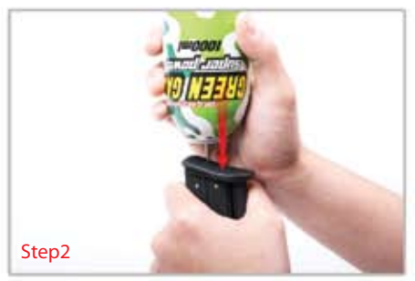
Keep the gas cylinder inverted and vertical to the Magazine Inject gasuntil completely filled