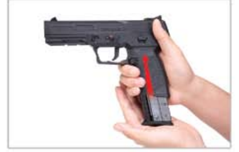
Insert the Magazine until you hear it click into place. The gun is ready to fire.